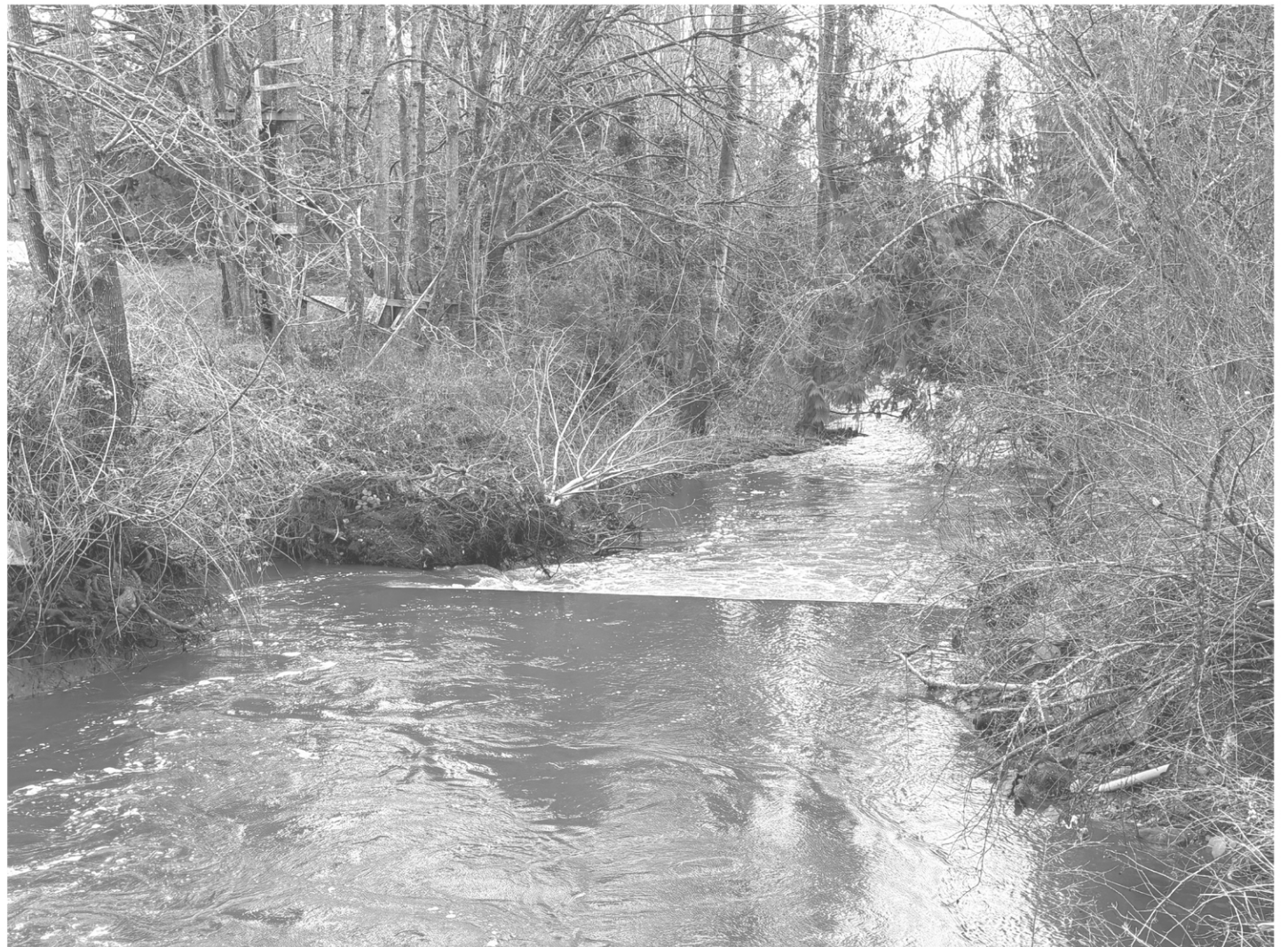
Photographed from upstream, water in Squalicum Creek flows over the weir.